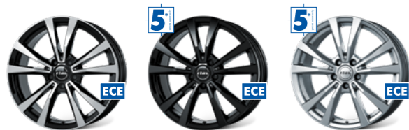
diamond-black front polished

17" (only diamond-black and polar-silver), 18", 19" (also SUV) and 20" (also SUV)