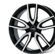
diamond-black front polished

Available in following sizes: 16", 17", 18" and 19"