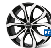
racing-black front polished

Delivery with blank center cap (RIAL center cap available as accessory)