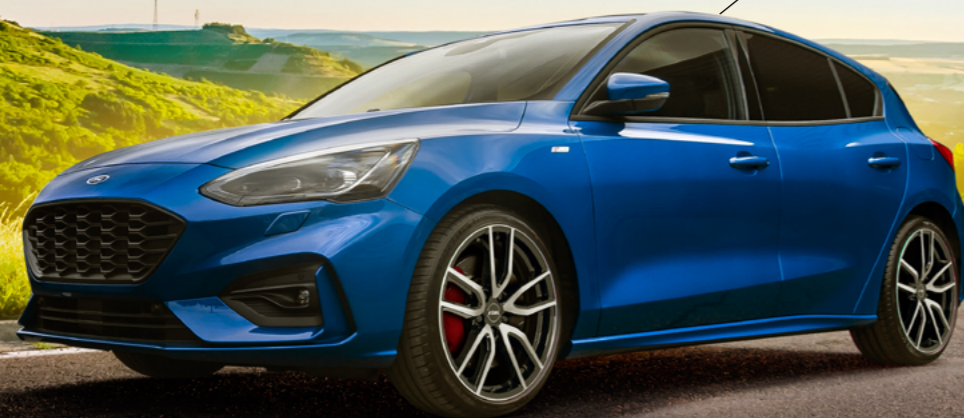
TORINO on Ford Focus