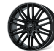
diamond-black lip polished

Available in following sizes: 20" and 21"