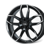
diamond-black front polished

Available in following sizes: 16" (also 4-hole), 17" (also 4-hole), 18", 19" and 20"