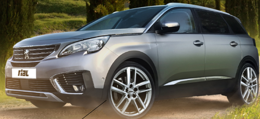
ASTORGA on Peugeot 5008