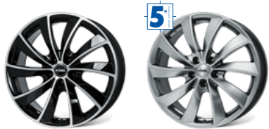
diamond-black front polished

Available in following sizes: 17", 18" and 19" (diamond-black front polished, 19" also in sterling-silver for Tesla 1 )