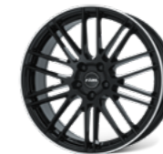
diamond-black lip polished

Available in following sizes: 18", 19" and 20"